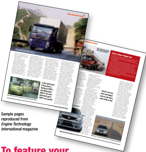
Sample pages reproduced from Engine Technology International magazine

To feature your company and technology, contact us now!