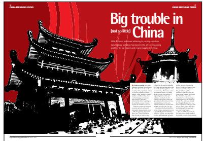
Sample pages reproduced from Engine Technology International magazine

Featuring 150+ pages and perfect-bound, Engine Technology China will utilize our proven formula of showcasing the latest engine developments with case studies, interviews and insightful reviews. Emission control will be a key focus with the Chinese Government imposing more and more legislation in-line with Western standards, while engine testing and durability will also have a prominent presence as quality becomes ever more significant in the market.